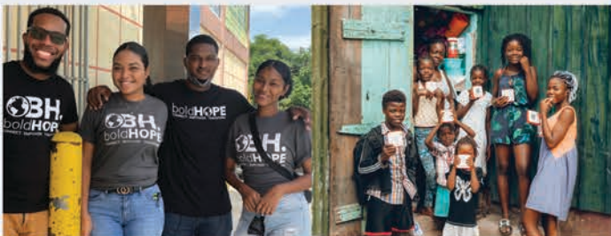
Belize: 150 grocery bags distributed to families in need during country shut down.

COVID also gave us the chance to dive deep with many of our partners - instead of communicating to plan trips, we were able to have conversations about how we could best meet their needs and what our support should look like in our physical absence. We are excited about opportunities to spend time in prayer and Bible study with the leadership of our partners around the world. Providing support to our brothers and sisters in Christ, in the form of regular encouragement, as they seek to grow closer to the Lord is a true blessing and we are privileged to be able serve them in this way.